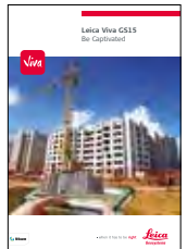
Leica Viva GS15