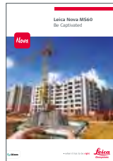
Leica Nova MS60

Illustrations, descriptions and technical data are not binding. All rights reserved. Printed in Switzerland – Copyright Leica Geosystems AG, Heerbrugg, Switzerland, 2015. 836338en – 05.15 – INT