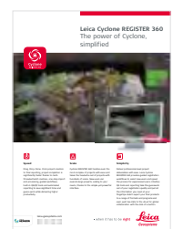
Leica Cyclone REGISTER 360