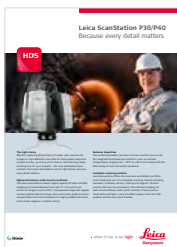
Leica ScanStation P30/40

Illustrations, descriptions and technical specifications are not binding. All rights reserved. Printed in Switzerland – Copyright Leica Geosystems AG, Heerbrugg, Switzerland 2016. 835466en - 03.17