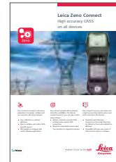
Leica Zero Connect