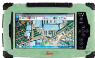
CS25 - ALL VARIANTS