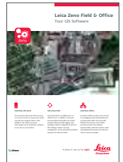
Leica Zero Field & Office