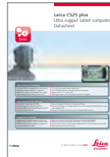
Leica CS25 plus