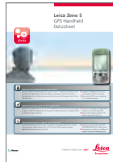
Leica Zero 5

Microsoft, Windows® and the Windows logo are either registered trademarks or trademarks of Microsoft Corporation in the United States and / or other countries.