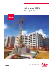
Leica Nova MS60