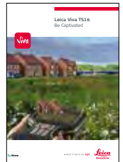
Leica Viva TS16